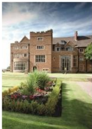
Ashorne Hill, Leamington Spa, Warwickshire, CV33 9QW 01926 488000 www.ashornehill.co.uk

We are always interested in recruiting local people. Please keep looking at our website for more opportunities within our organisation www.ashornehill.co.uk .