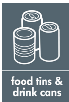
food tins & drink cans