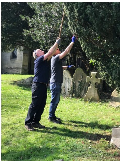
Churchyard clearance or aerobics!