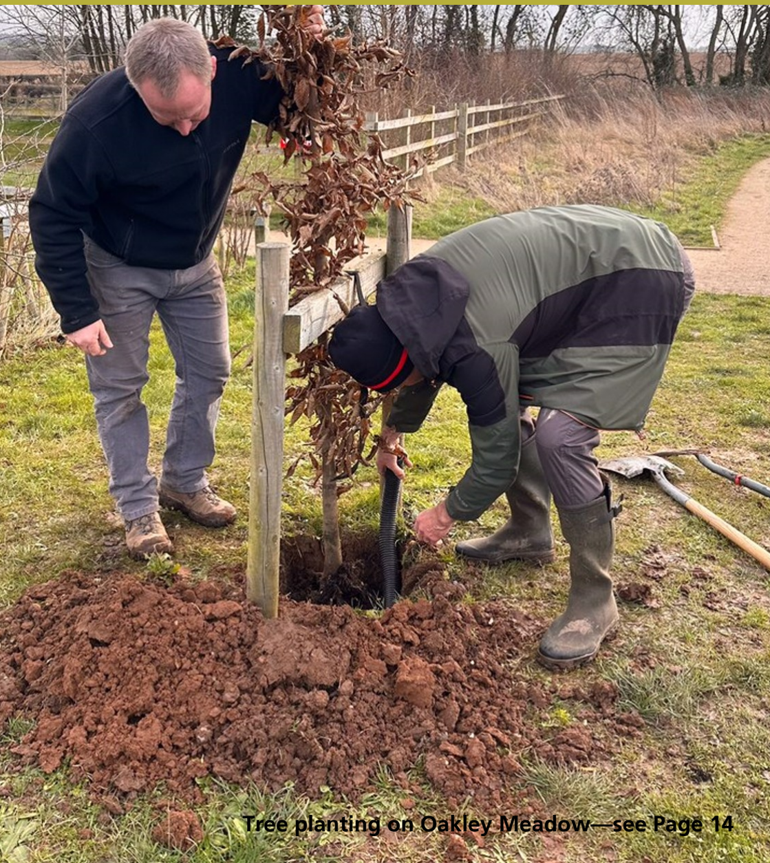
Tree planting on Oakley Meadow—see Page 14

Your magazine featuring news and views from Bishop's Tachbrook Parish.