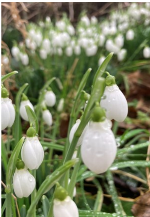
Vicarage Snowdrops 2024

‘Take your everyday, ordinary life – your sleeping, eating, going-to-work, and walking around, and place it before God as an offering. Embracing what God does for you is the best thing you can do for him.’ The Message Translation of Romans 12. 1-2