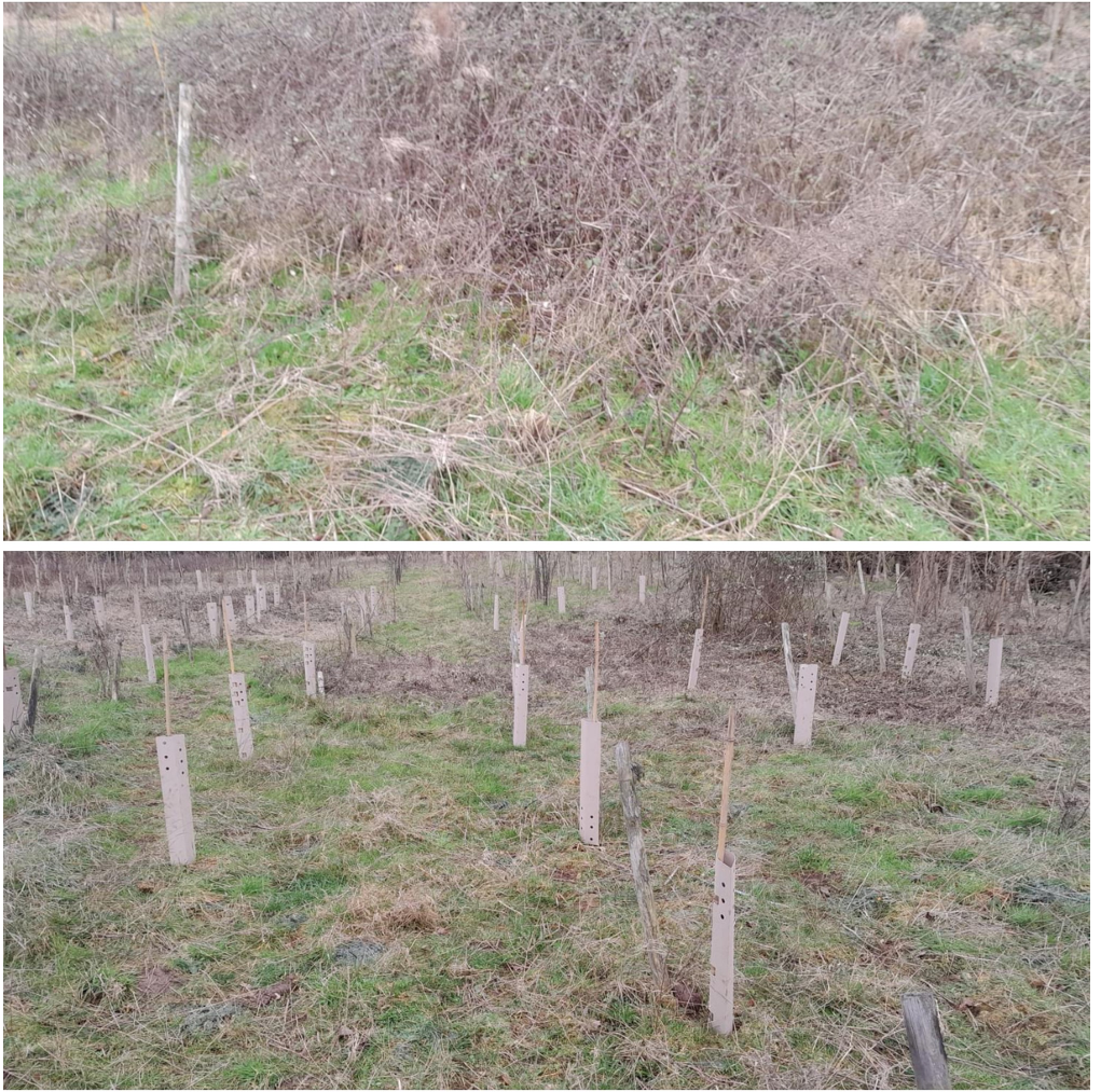
Before and After picture of the sapling planting